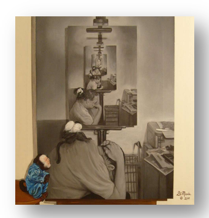
Francesco DiMaria, As My Monkey Waits , 2010, acrylic on canvas, 42" x 42".