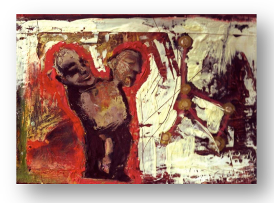
Kristen T. Woodward, Two Headed Monster , 2010, encaustic on panel, 7.5" x 6".