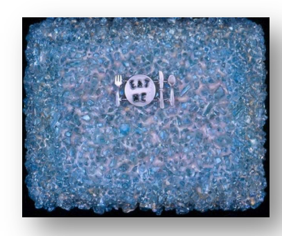
Vick Vercauteren, Anxiety Cake , 1998, glass and mixed media on canvas, 7" x 9" x 2.5".