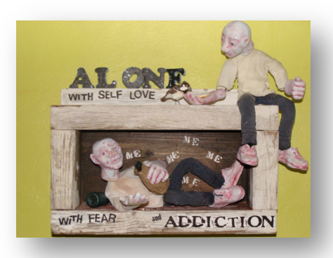
Joan Matey, To Feel Or Not To Feel; Escape Through Addiction , 2009, painted polymer clay, wood, cloth, 16" x 14" x 7.5".