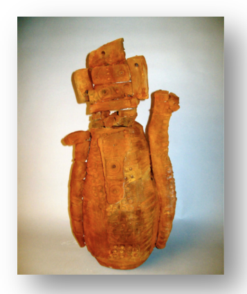
Judith Gehrmann, Rust Shrine #1 , 2009, ceramic, 30" x 17".