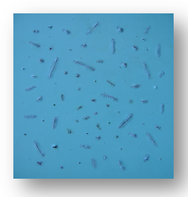
Sunny Spillane, Recovery , 2010, acrylic on linen with punctures and embroidery floss, 24" x 20".