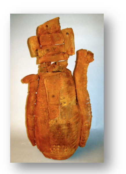
Judith Gehrmann, Rust Shrine #1 , 2009, Ceramic, 30" x 17".

Please Return to: FSU Museum of Fine Arts Room 250 FAB Tallahassee, FL 32306-1140