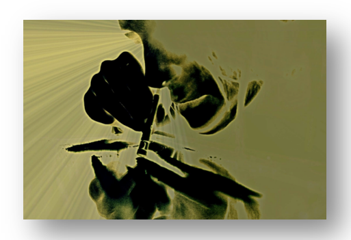
Kelly Garrett, Rays of Hope in Dissolving Dreams , 2010, photography, 11" x 14".