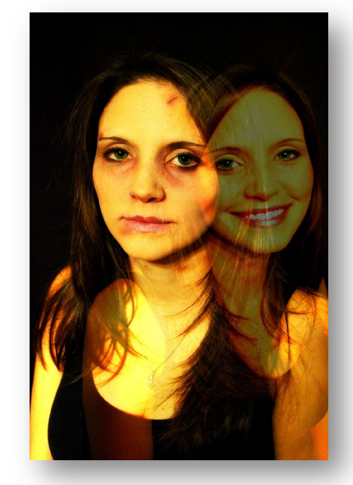
Kelly Garrett, Before and After , 2010, Photography, 11" x 14".

Objective: To help students understand the ways art brings awareness to issues such as addiction.