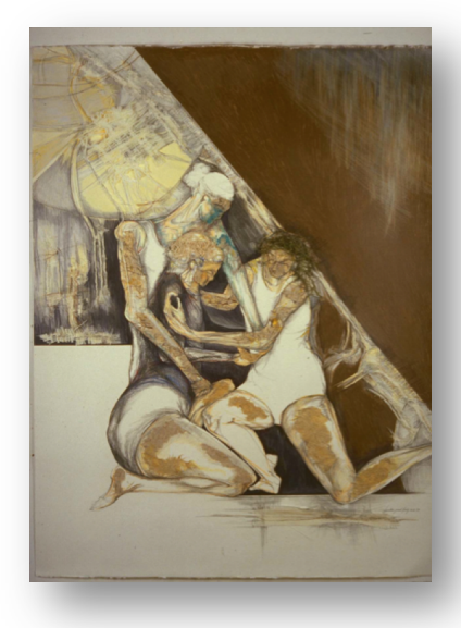
Donalee Pond-Koenig, Inner Space and Soul , 1997, pencil, 29.5" x 41.5".