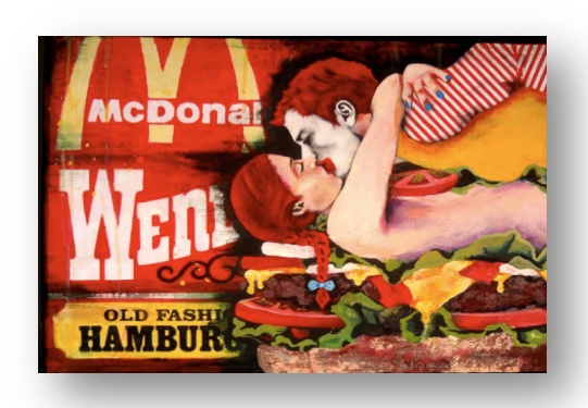
Angela Teeter, Fast Food , 2010, mixed media and acrylic on canvas, 18" x 24".