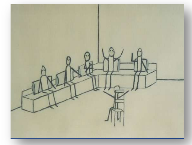
Chris Babson, Stick Figure Intervention , 2006, Acrylic on Canvas, 25" x 35".

Objective: To have the students understand that making decisions results in consequences, good and bad.