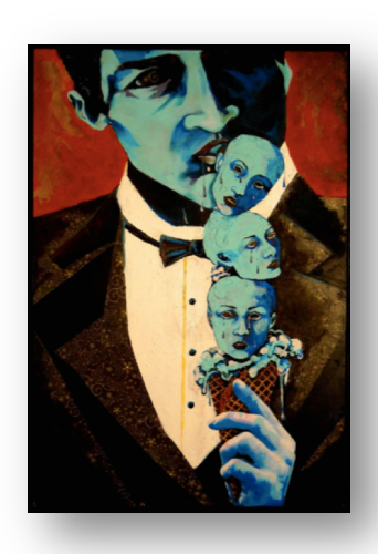
Angela Teeter, Memoirs of a Womanizer , 2010, mixed media and acrylic on canvas, 18" x 24".