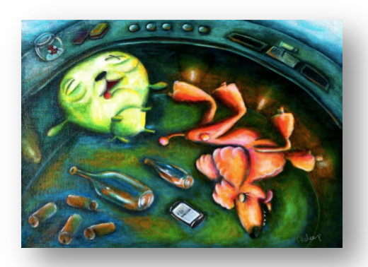
Alejandra Leibovich, The Morning After , 2010, acrylic on canvas, 11" x 14".