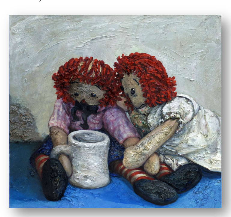
Suzy Kitman, Raggedy Ann Tried Telling Andy the Party Was Over , 2010, Oil on Canvas, 16" x 16".

According to a survey from the U.S. Department of Health and Human Services in 2008, an estimated 118,495 emergency department visits involved illicit drug use by older adults (persons aged 50 or older). There were 527 faith-based substance abuse treatment facilities or facilities affiliated with a