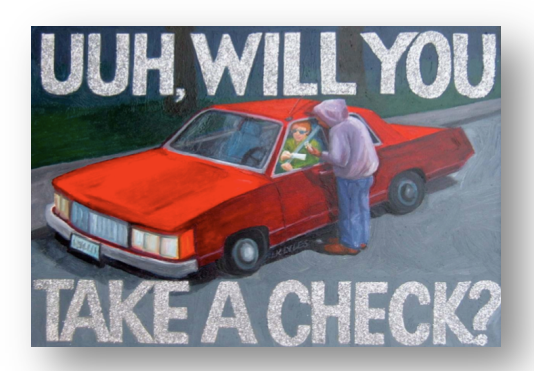
Kelly Lyles, Will U Take a Check , 2009, oil and glitter on canvas, 17" x 21".