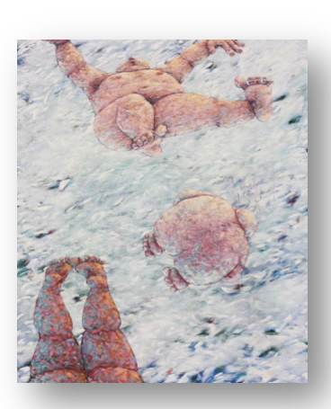
Jeanne Greenleaf Lebow, Feeling No Pain , 2008, oil on linen, 36" x 48".