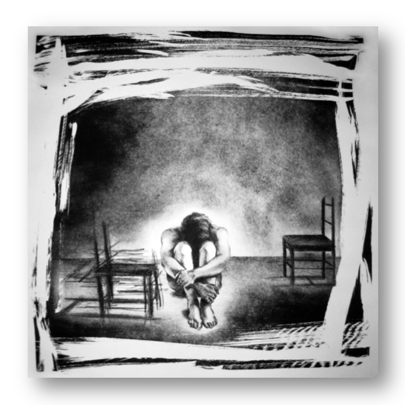
Elizabeth Katz, Indecision, 2007, Lithograph, 16" x 14".

Using an image from the exhibit as an example may engage students in meaningful exploration of their experiences and may encourage students to create their own art about drug and alcohol abuse issues. The four protocols that follow echo the four themes in the art education section of the packet. Each protocol includes an art image from the exhibition, discussion points and questions for student responses, and ideas for student creation of their own art in response to the theme.