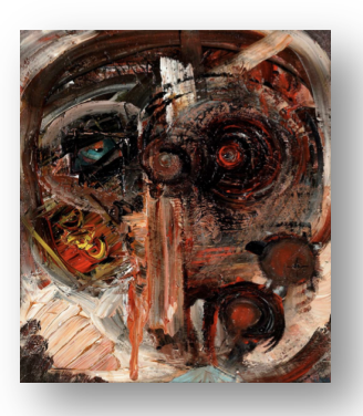
Charlie Lewis, Intensive Care , 2010, mixed media on canvas, 40" x 32".