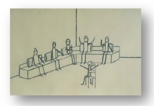
Chris Babson, Stick Figure Intervention , 2006, acrylic on canvas, 25" x 35".