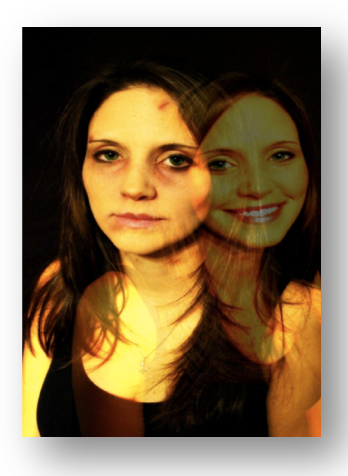
Kelly Garrett, Before and After , 2010, photography, 11" x 14".